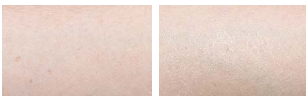
Forearm treated on the right with a gel containing Luminescine 4% w/w, effect in full sunlight

CHINA STATUS: also available in China compliant version.